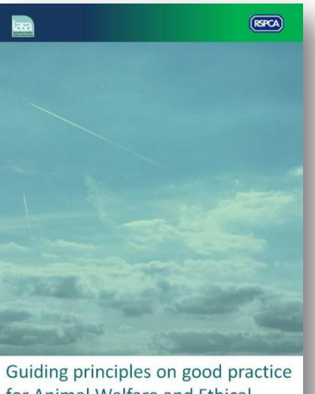
Guiding principles on good practice for Animal Welfare and Ethical Review Bodies 3rd Edition – September 2015

The RSPCA/LASA Guiding Principles on Good Practice for Animal Welfare and Ethical Review Bodies, 3<sup>rd</sup> edition provides a brief, clear overview of common ERB tasks and good practice for meeting these: tinyurl.com/RSPCA-LASA-AWERB