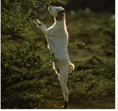
Goats are browsers and can rear up to reach foliage.

Goats are sensitive and curious animals that can make good companions or smallholding stock, but only if provided with the proper environment and care.