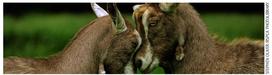
Butting often occurs when unfamiliar goats are introduced.

Owners with excessively aggressive goats should seek advice (for example from the BGS, or the RSPCA farm animals department), as to humane ways of discouraging this behaviour.