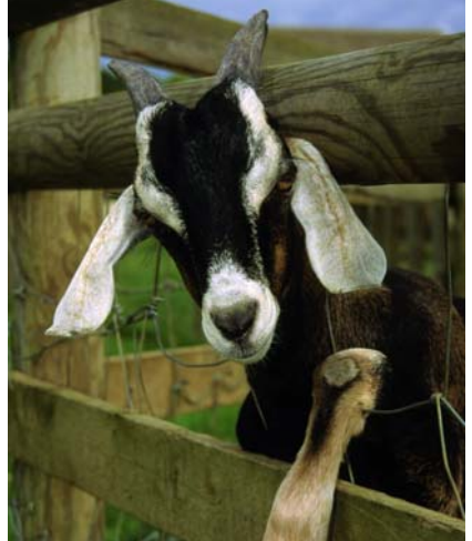
Goats can become trapped in unsuitable fencing.