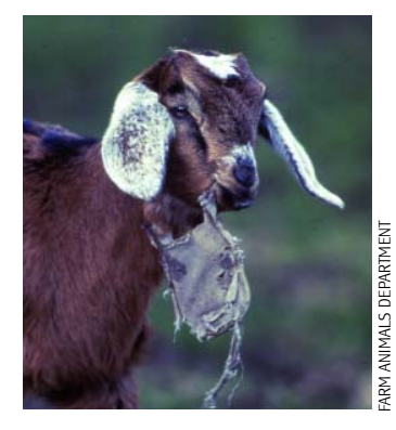
Care must be taken not to leave objects lying around that goats might consume!

Being browsers, goats tend to inspect and nibble/eat most things in their environment. Care must therefore be taken not to leave items such as plastic bags, cloths, pieces of bailer twine and other small objects in places where goats can access them, as this could lead to the goats choking or suffocating. Fences and woodwork should also not be coated in anything that might be toxic to the goats if consumed.