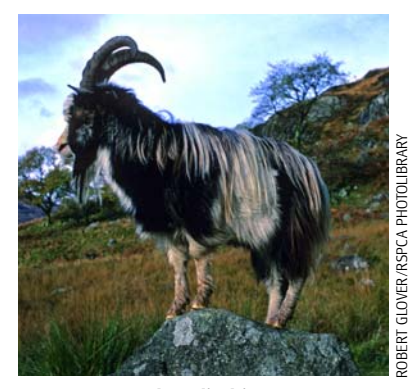
Goats are good at climbing over rocky terrain.