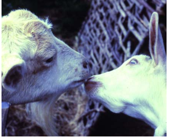
Goats are highly social animals.

Goats are social herd animals that do not usually cope well with being kept singly. Potential owners must therefore consider their duty of care under the Animal Welfare Act 2006, and provide goats with suitable social companionship. Owners should plan to allow at least two goats, that get on well, to live together. Ideally, it is best to acquire two or more goats from the same herd that are already companions, as it can be difficult to introduce new individuals to an existing herd (see Aggression , page 30).