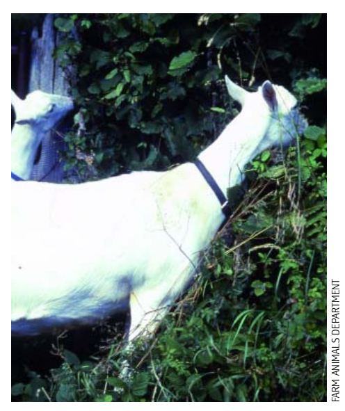
Saanen goats browsing.

Goats are browsing animals and prefer not to eat anything that has been on the floor. As they are experts at turning over buckets and tossing hay onto the ground, they can be very wasteful. Hayracks should be used and are available at many agricultural merchants. These need a lid and should be positioned at such a height that they cannot be fouled.