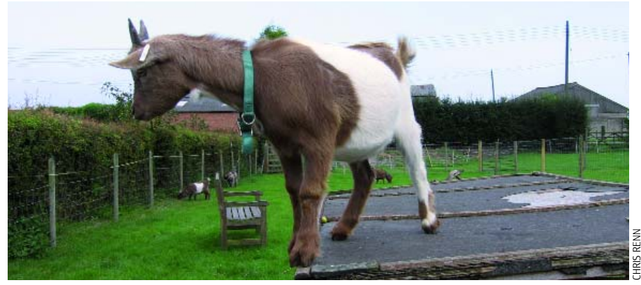
Goats appreciate the opportunity to climb.

Goats should be encouraged to walk alongside the owner by, in the first instance, placing a hand on the rump and gently encouraging the goat forward accompanied by the rewards. Goats must never be pulled along on a lead and it is important to choose head collars or body harnesses that will not choke the goats. Biosecurity should also be considered when walking goats, with care taken not to spread disease, or take the goats to areas where they might come into contact with diseases they could bring back to the herd.