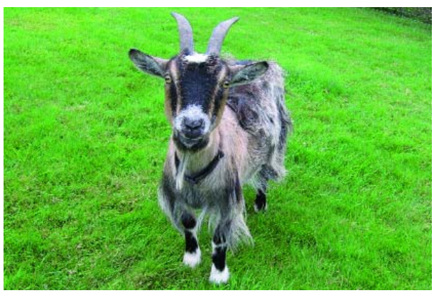
A pygmy goat.

would like to own. Pygmy goats are often thought to be particularly suitable for novice owners. These naturally tiny goats, which originated in Africa, usually grow to around 40 to 56cm (16 to 22 inches) at the withers (shoulders). They possess a great deal of character and, being small, are easier to handle and manage.