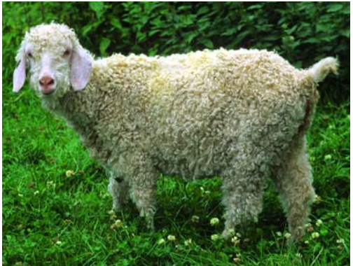
Angora goat exercising.

Large yard areas can provide an acceptable way of keeping a small number of goats. They have the advantages that the goats' hooves are worn down by the rough surface and internal parasites that live on grass/soil do not proliferate as readily. However, in such systems, all of the goats' food needs to be brought to them and presented in a manner that allows them to fully express their natural browsing behaviour. Enough space must also be provided to allow the