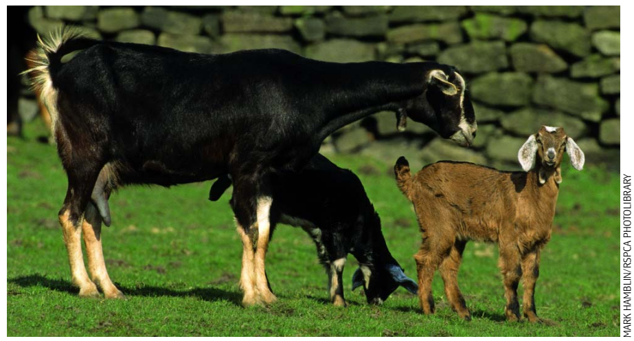
British cross-breed goat with kids.

Novice goat owners should have lessons with an experienced and competent goat owner to ensure that the procedure is effective and that the goat's welfare is not compromised by poor technique. It is vital to maintain the highest standards of dairy hygiene in order to prevent mastitis (see Health , opposite) and avoid poor tasting milk.