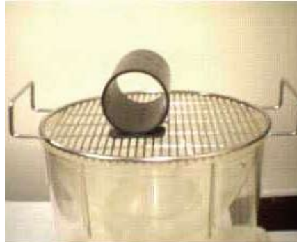
Figure 1. Tunnel insert for use in metabolism cages

Group housing is our standard; five rats per cage or trios for mice. Any requirement for single housing must be authorised by the Named Veterinary Surgeon and Named Animal Care and Welfare Officer (NVS and NACWO; two posts required under UK law) before studies begin. There are some exceptions on veterinary or welfare grounds, such as some surgically prepared animals, dermal studies and male mice of specific strains. However, some clients have traditional preferences for single housing. We always challenge this and encourage them to comply with our welfare policy; they often agree to group housing for their animals. We have also challenged the requirement for single housing in the US Food and Drug Administration “Red Book” regulations for food additive tests, but unfortunately unsuccessfully to date. We also have to report the percentage of animals individually housed to the ERP and, again, the ERP has been influential in increasing accountability and bringing the numbers of singly housed animals down (Fig. 2).