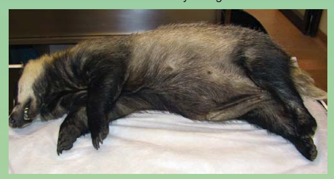
Adult female badger sedated for examination

Commonly used intravenous and gaseous anaesthetic drugs have been used in badgers using standard canine doses. By far the easiest method of chemical restraint in most circumstances however, is a combination of medetomidine and ketamine together in the same syringe, given by intramuscular injection. A dose of 5.0-7.5mg/kg of ketamine plus 40µg/kg medetomidine is used. This equates to 0.5ml ketamine (100mg/ml) plus 0.4ml medetomidine (1mg/ml) for an average 10kg adult badger. Animals should ideally be weighed in order to calculate accurate doses. Medetomidine should be reversed as soon as procedures are completed using an equal volume of atipamezole (200µg/kg of 5g/ml solution) given intramuscularly, no adverse ketamine related reactions have been observed by doing this.